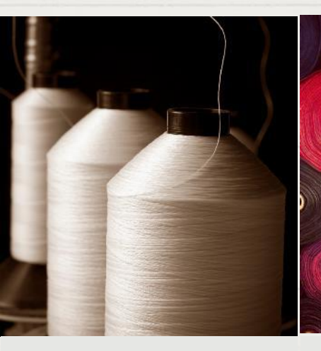
YARNS & FIBRES