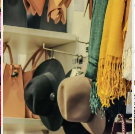
APPARELS & FASHION