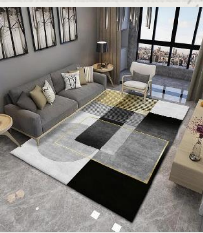
HANDLOOMS & CARPETS